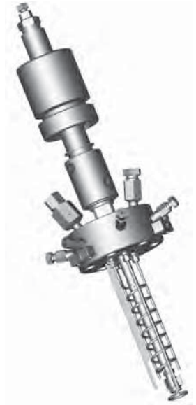
300 ml EZE-Seal Reactor Internals

** Overall height based on belt driven units. For actuals see standard drawings.